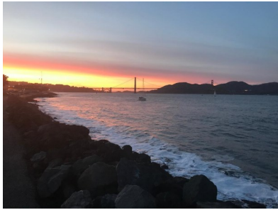
Sunset View from the America's Cup Room

With an uncompromising view of the Golden Gate Bridge, Sausalito, Tiburon, Alcatraz and the San Francisco Bay, GGYC is home to one of the best and most sought after views in the Bay Area.