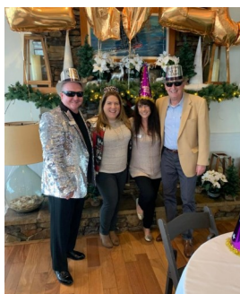
GGYC Officers and Directors celebrating New Years Day

The Club also hosts our renowned Manual Fagundes Seaweed Soup Regatta (our Midwinter regatta) as well as our favorite Friday Night Beer Can Series. Whether you are a racer or prefer to enjoy the races from the shore, there is something for everyone, and our Race Committee is always happy to introduce novices to the exciting arena of sailboat racing. Whether you enjoy the thrill of sailboat racing or prefer to watch from the cozy fireside with a glass of wine, Golden Gate Yacht Club has the best seats in the house (or the Bay!)